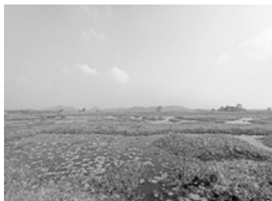
Figure 1. b. Nitai Beel