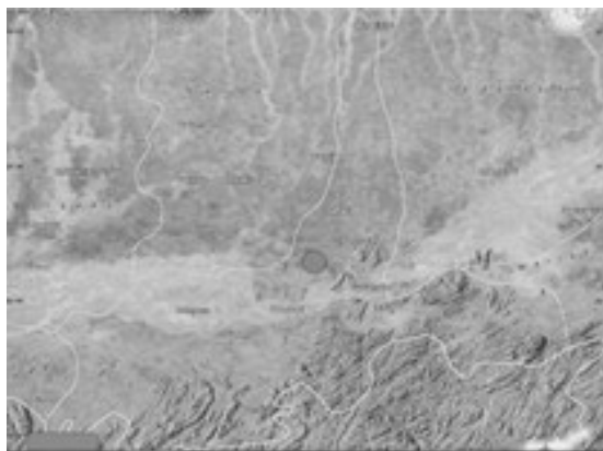
Figure 1. a. Map showing the study area

The present study was done in Nitai beel , located on the flood plain of Kolajal River, at a distance of 05 km from Sualkuchi and 35 km. from Guwahati with a total area of 50.68 hectare. It lies between 91^{\circ} 31'06'' E longitude & 26^{\circ}11'52'' N latitude (Figure 1a & 1b). The climate of the studied area remains mild throughout the year. It falls under tropical monsoon climate. The annual average recorded temperature is 22.67^{\circ}\text{C} , annual average rainfall is 159.7 cm, and annual average humidity is 81.01%. The Nitai beel is endowed with rich floral and faunal diversity.